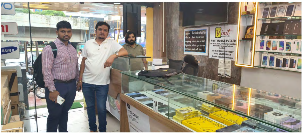
Photos of Other retails Stores located in various clusters